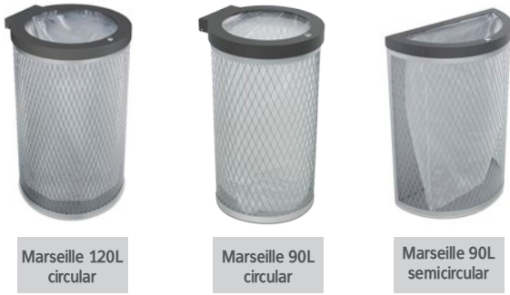
Marseille 120L circular