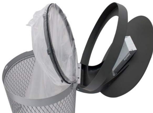
Detail of the opening and bag holder system 120L and 90L circular