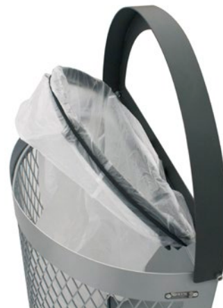
Detail of the opening and bag holder system 90L semicircular