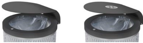
Marseille with Rainhood